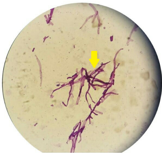
Figure 2 Branched and pink colored bacilli in acid fast stained smear

According to the sign and symptoms of the patient and CSF pattern, antibiotic regimen was changed to meropenem and intravenous co-trimoxazole (to treat nocardial meningitis).