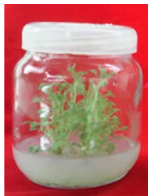
Fig. 1. Artemisia aucheri plant cultivated with tissue culture technology.

Plant tissue culture technique as a rapid and fast method under controlled conditions in cultivation of medicinal and aromatic plant has recently received a lot of attention as an effective method for the production of valuable secondary metabolites. As mentioned in plant material part, we used A. aucheri tissue culture samples for this study. Stem sections with one node were cut from parent plant and transferred to jars containing MS medium. After one week, the root appeared on the stem sections and gradually new leaves and buds were also observed. Cultivation period was one month and all plant cultivation steps were kept under sterile conditions. Thus, the obtained plants with this method were grown under in vitro condition which is different with plants grown in the field condition (Fig. 1).