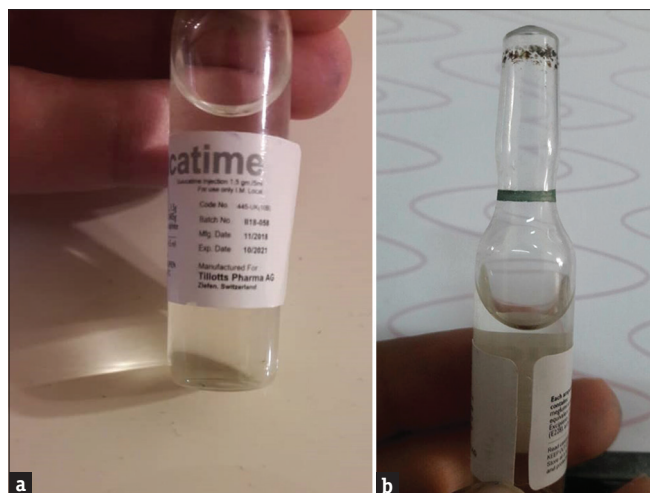
Figure 2: Low-quality packaging (a) and visible sediment particles (b) in “Gulucitime” ampules