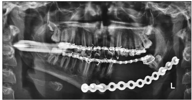
Figure 3: After the resection, a preformed locked 12-hole titanium reconstruction plate with 6, 9-mm screws were placed for functional and esthetic rehabilitation.

An intraoral radical RsCD from the mandibular canine up to the 2 nd molar was performed with a safe margin of 1 cm. Reconstruction plate was adopted with approximated resected segment before resection. After the resection, a preformed locked 12-hole titanium reconstruction plate with six, 9-mm screws were placed for functional and esthetic rehabilitation [Figure 3]. Examination of the gross resected specimen showed a significant deformity, especially on the buccal surface, which had several perforations, characteristically asymptomatic, and associated with vital teeth and normal mucosa. Myxoma would certainly have to be included in the differential diagnosis.