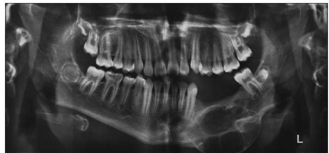
Figure 1: A panoramic radiograph disclosed a large honeycombed radiolucent area extending from the mandibular left canine to the second molar.

The patient was admitted into Imam Reza Hospital of Tabriz University of Medical Sciences for cell blood count analysis, biopsy, and enucleation and curettage. The biopsy specimen showed a firm, rubbery, white,