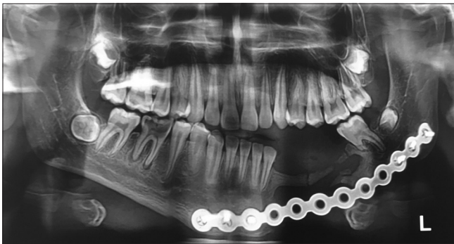
Figure 4: The rare incidence noticed almost 3 months after surgery was the regeneration of both sides of the resected mandibular stumps to reach each other from the upper border.

Espinosa et al. (2010) reported that other factors are the preservation of an intact periosteal layer and young patients. The first factor is believed to serve as a source of osteogenic progenitor cells, providing a vascular supply to the newly-forming bone and as a barrier to inhibit soft-tissue prolapse.