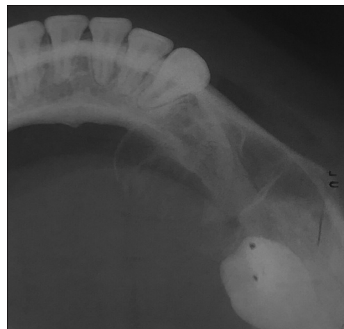
Figure 2: An occlusal radiograph showed that the lesion extended almost to the lingual aspect and close to the buccal border of the posterior mandible.