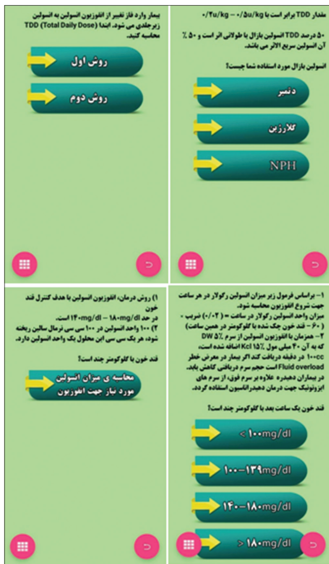
Figure 2: Some screenshots of different parts of the app

described the application to be user-friendly (high and very high). Moreover, 69.3% reported the application to be very necessary for health providers, especially physicians [Figure 2]. More than 77% of physicians described that the design of application is appropriate, 88% mentioned that the texts are understandable and legible, and 80.4% described the different steps of application are well sequenced. Based on the appraisal, the application has helped physicians in course of treatment process. Using the software was easy for the vast majority of physicians. More information is provided in the Table 1.