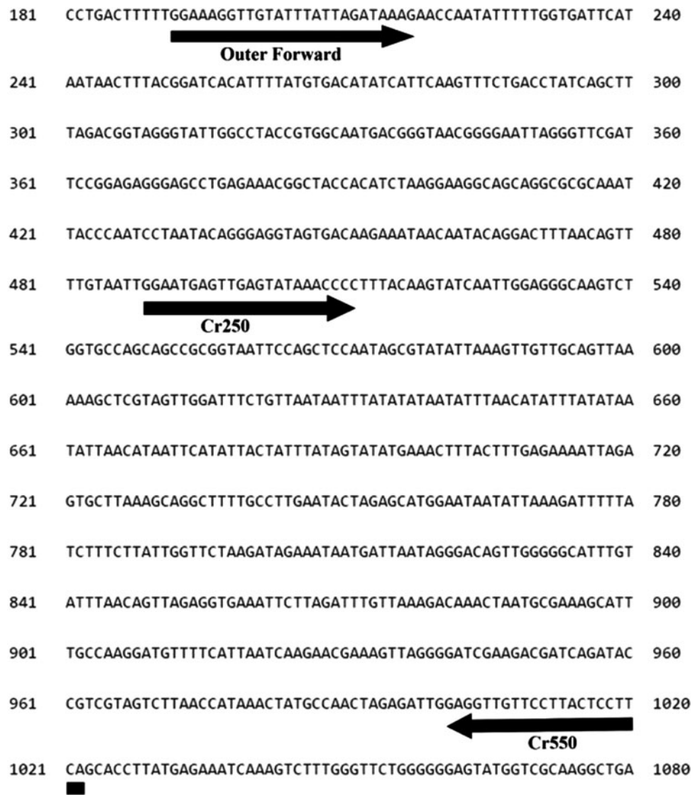
FIG. 2. Seminested PCR (for identification of Cryptosporidium spp.) primer positions have been shown on C. canis 18S rRNA gene (GenBank acc. no. AF112576.1).