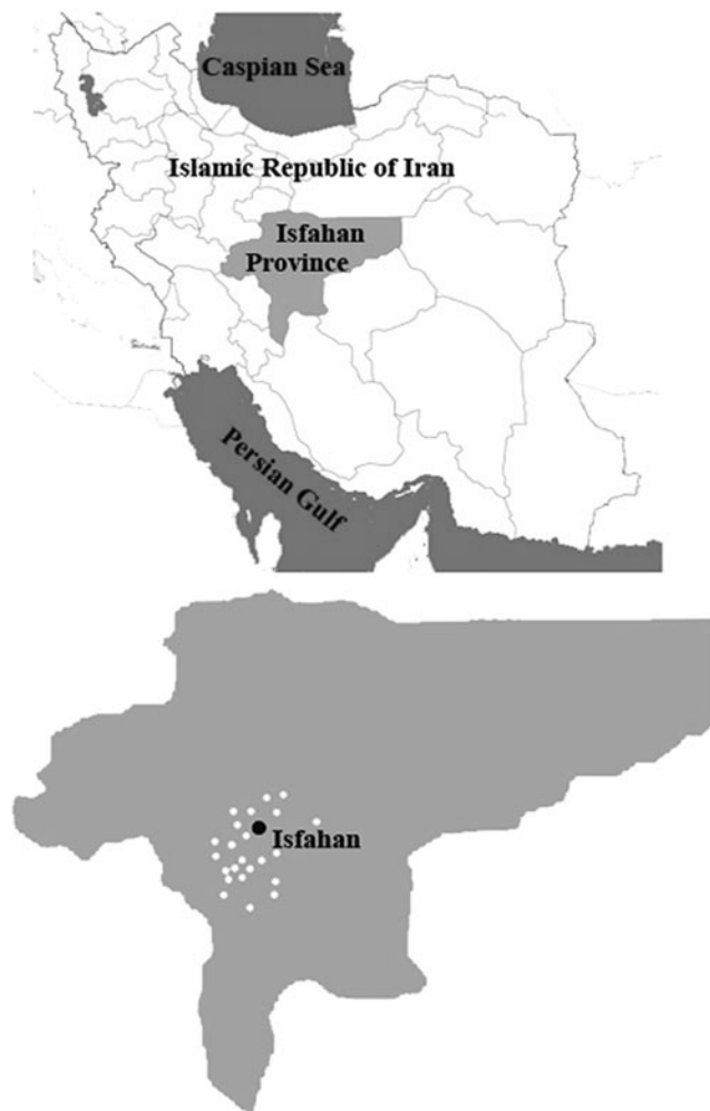
FIG. 1. Locations of herd dog fecal samples collected from Isfahan, Iran.

Average age of studied dogs was 27 months, with the frequency of 51 females and 89 males. Using morphological criteria, the overall rate of infection with Cryptosporidium was 2.14% (3/140) (Fig. 3), all of them were positive in