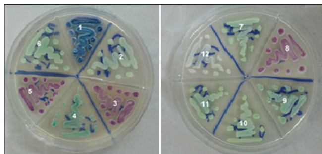
Figure 1: Appearance color of Candida colonies, isolated from the mouth of drug smoker addicts on CHROMagar Candida medium No. 1 shows Candida tropicalis , no. 2, 4, 6, 7, 9, 10 and 11 indicate albicans/dubliniensis complex, no. 3, 5 and 8 demonstrate Candida glabrata and no. 12 shows a non-albicans Candida species

To carry out the PCR reaction for each sample, a mixture of 12.5 \mu l of ready-to-use Master Mix (AMPLIQON, Denmark), 3 \mu l of DNA template, 0.5 \mu l of both primers (concentrated at 10 pmol), and 8.5 \mu l of sterile double distilled water were prepared to obtain 25 \mu l final volume per reaction.