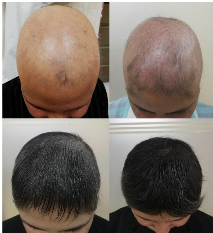
Figure 2. Disease improvement in the combination therapy group after nine months of treatment. (A) Pretreatment, (B) Three months after the treatment, (C) Six months after the treatment, and (D) Nine months after the treatment.

b Increase in photographic score reflects improvement in the disease.