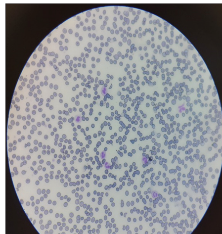
Figure 2: Peripheral blood showing schistocytes, characteristic of microangiopathic hemolytic anemia

In this case, we observed decreasing levels of platelets, which we assume may be a result of an immunologic reaction seen in many viral infections [14] and has been previously suggested to occur as an autoimmune