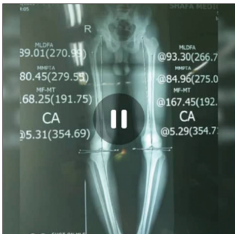
Figure 2: The alignment view radiography before surgical procedure representing medial proximal tibial angle of 80° and 84° in right and left sides, respectively

SD: Standard deviation, MPTA: Medial proximal tibial angle