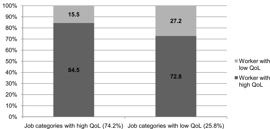
Figure 1 Distribution of level-one latent classes (n=3063 employees) within level-two latent classes (n=71 job categories).

To the best of our knowledge, the current study is the first one that was conducted on employees and classified individuals by considering all aspects of QoL and constructed two parsimonious and comprehensive measures